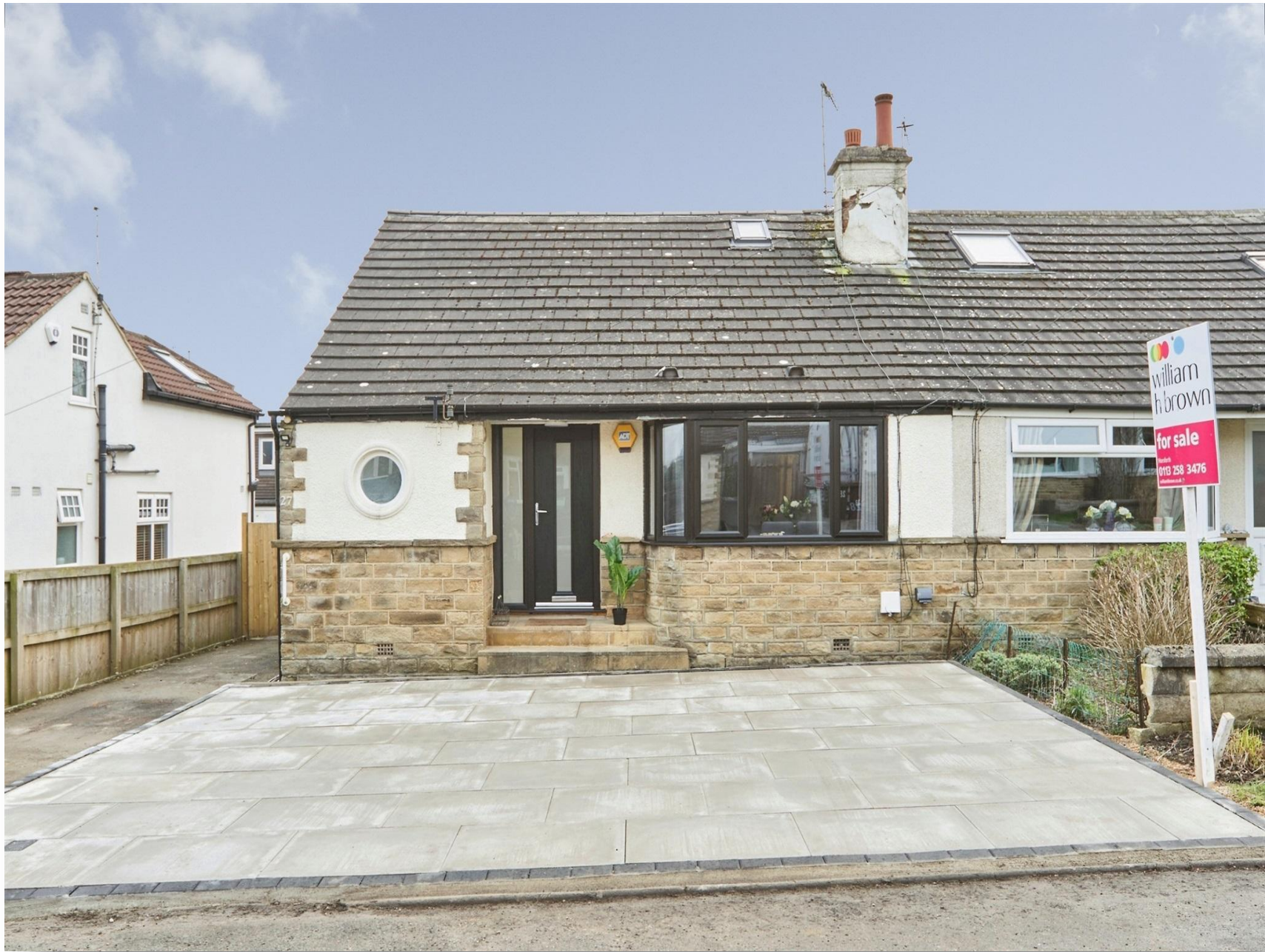
The Cedars, Bramhope Leeds LS16 9EA