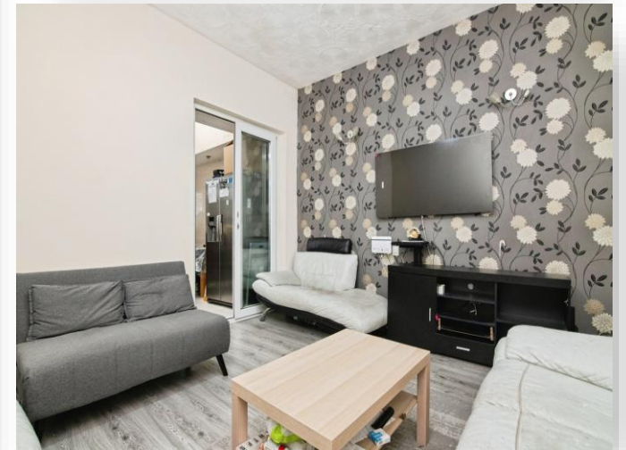
Kenilworth Road, Aston Birmingham B20 3HG