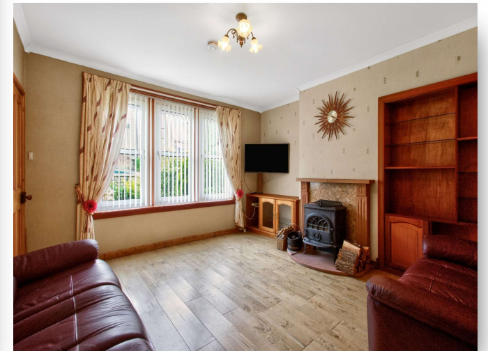
Gillies Hill, Cambusbarron, Stirling, FK7 9PG