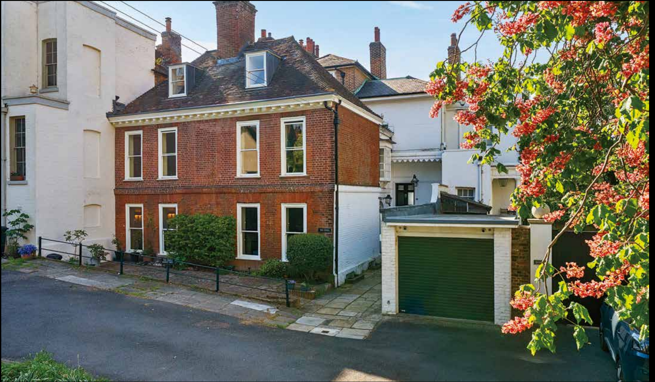
The Friars Boley Hill | Rochester | Kent | ME1 1TE