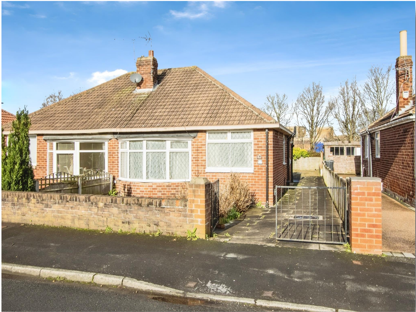
Kennerleigh Drive, Leeds LS15 8RZ