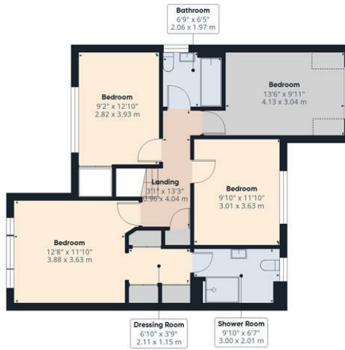
First Floor Building 1