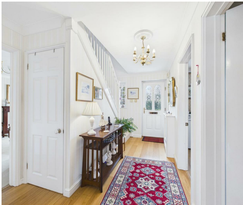
Argyle Drive, Chippenham