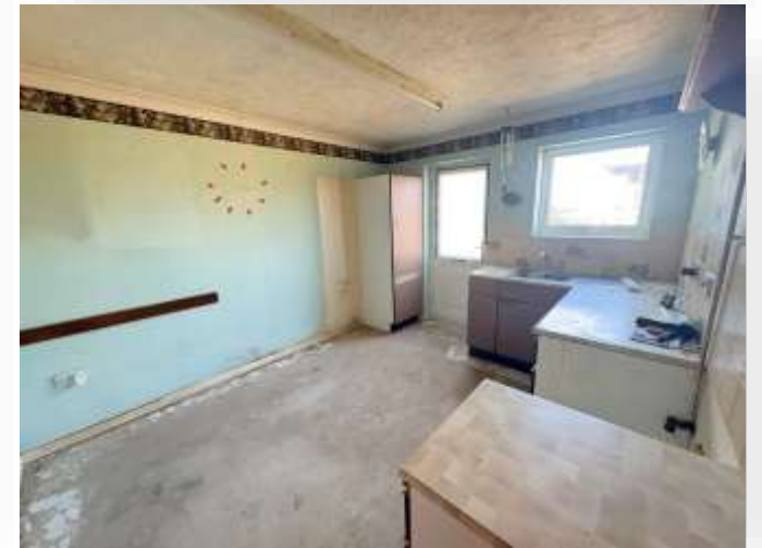
Winston Way, Farcet Peterborough PE7 3BU