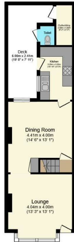
Ground Floor Floor area 43.9 sq.m. (472 sq.ft.)