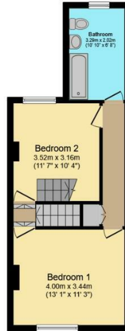
First Floor Floor area 38.6 sq.m. (416 sq.ft.)