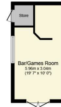
Outbuilding Floor area 17.8 sq.m. (192 sq.ft.)

Total floor area: 120.4 sq.m. (1,296 sq.ft.)