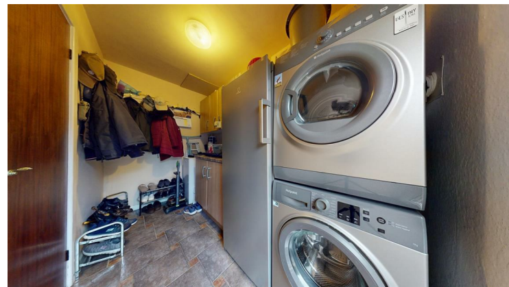
UTILITY ROOM/SIDE HALL 3.10m x 1.55m (10'2" x 5'1")

Plumbing for washing machine and tumble dryer and space for upright fridge/freezer, fitted base and wall units and a Worcester oil fired boiler providing heating and hot water. Double glazed door to rear.