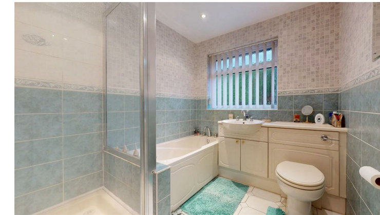
BATHROOM 3.10m x 2.08m (10'2" x 6'10")

Modern suite comprising panelled bath, separate walk-in shower cubicle with glazed screen, fitted cabinet incorporating wash basin and WC, part tiled walls with some decorative dado with mosaic-effect wall finish above, double glazed window with blind, wall mirror and radiator.