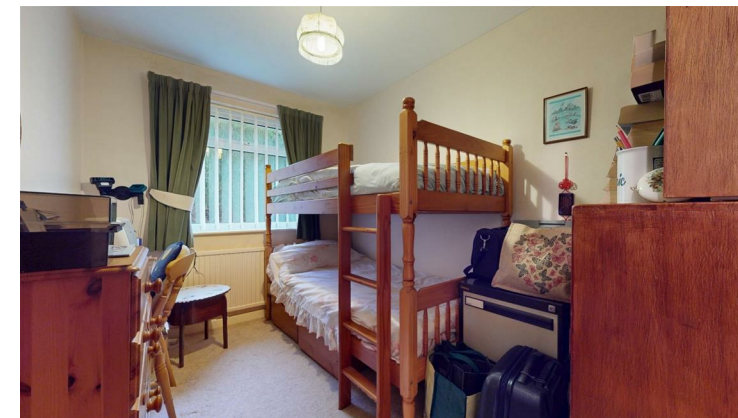
BEDROOM 4 3.10m x 2.26m (10'2" x 7'5")

Double glazed window with blind, panelled radiator and a wall mounted bookcase..