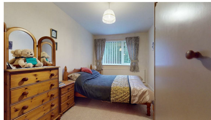
BEDROOM 2 4.11m x 2.46m (13'6" x 8'1")

Outbuilt wardrobe with locker storage cupboard over, double glazed window with blind and panelled radiator.