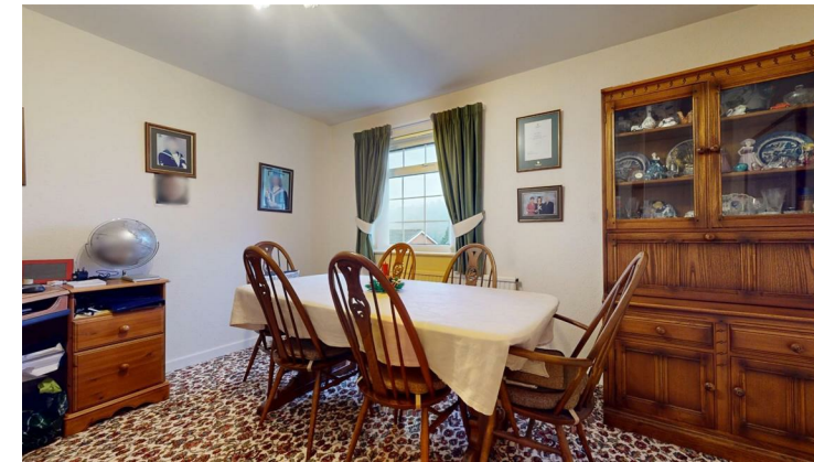
DINING ROOM/BEDROOM 3 3.84m x 3.23m (12'7" x 10'7")

Currently used as a dining room it provides a spacious room with Georgian style double glazed window to front and panelled radiator.