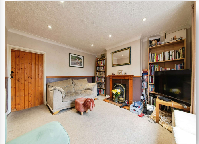
Kyme Road, Heckington Sleaford NG34 9RS