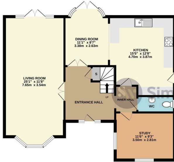
GROUND FLOOR 808 sq.ft. (75.1 sq.m.) approx.