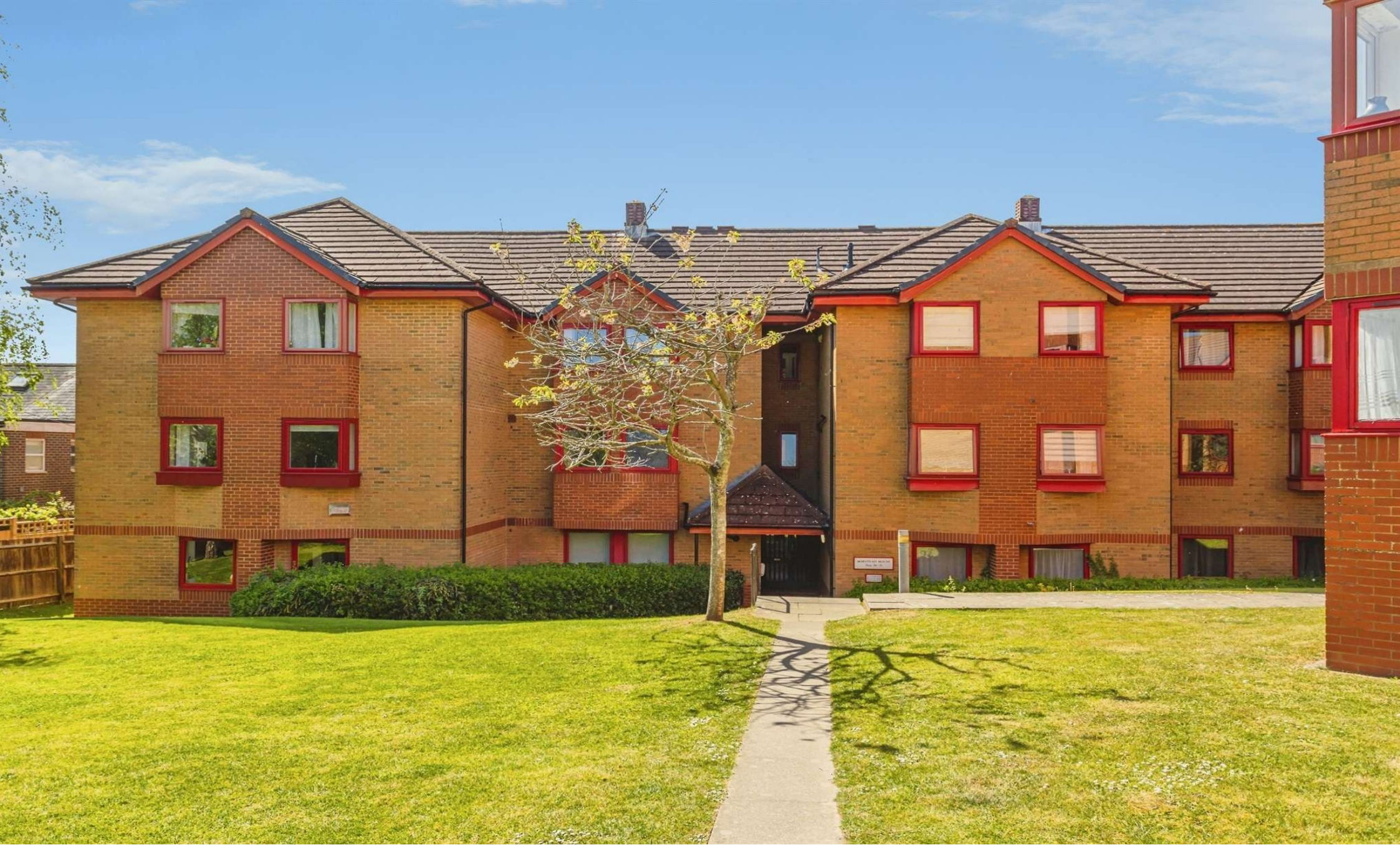
Horsted House, Whitelands, Franklynn Road, Haywards Heath RH16 4HR