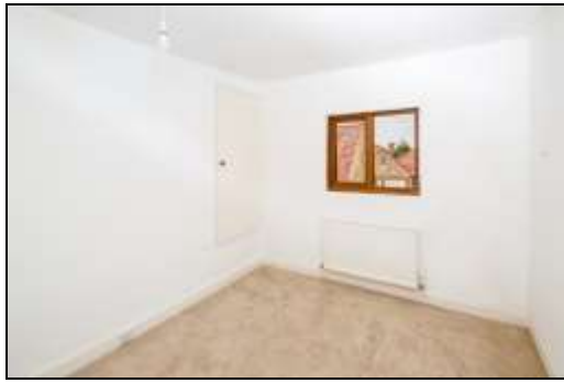
Bedroom Two & airing cupboard