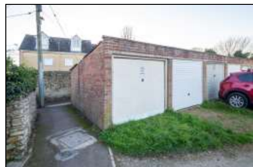
Garage in Block