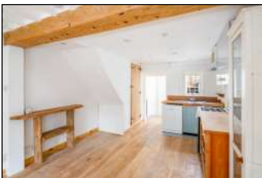
Open Plan Kitchen-Dining Area