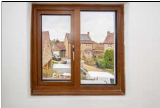
View through Bedroom Two Window