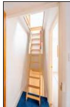
Access to Loft Space and Boiler