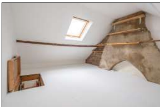
Lined & Floored Loft Space