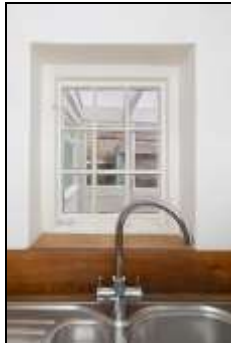
Rear Lobby, view through the kitchen window to the Utility Lean-To