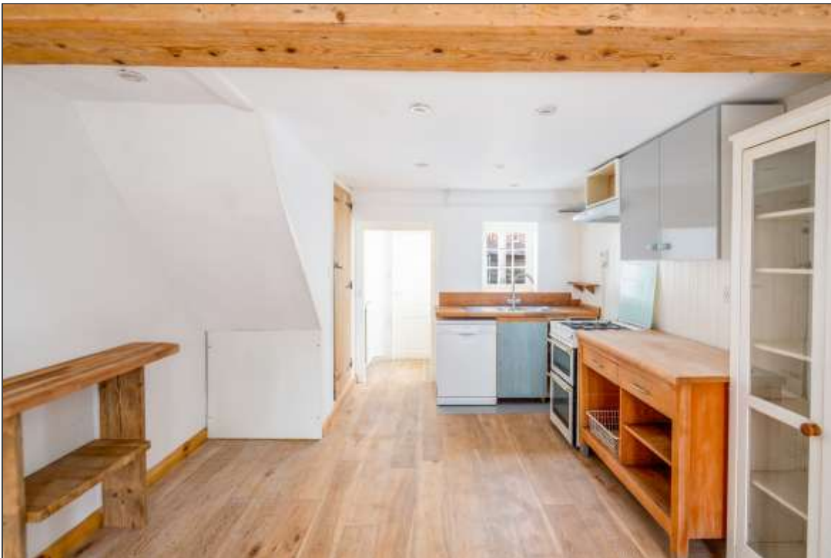
Open Plan Kitchen-Dining Area