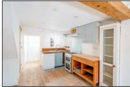
Open Plan Kitchen-Dining Area