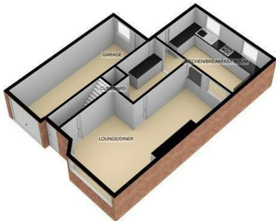
GROUND FLOOR 65.6 sq.m. (706 sq.ft.) approx.