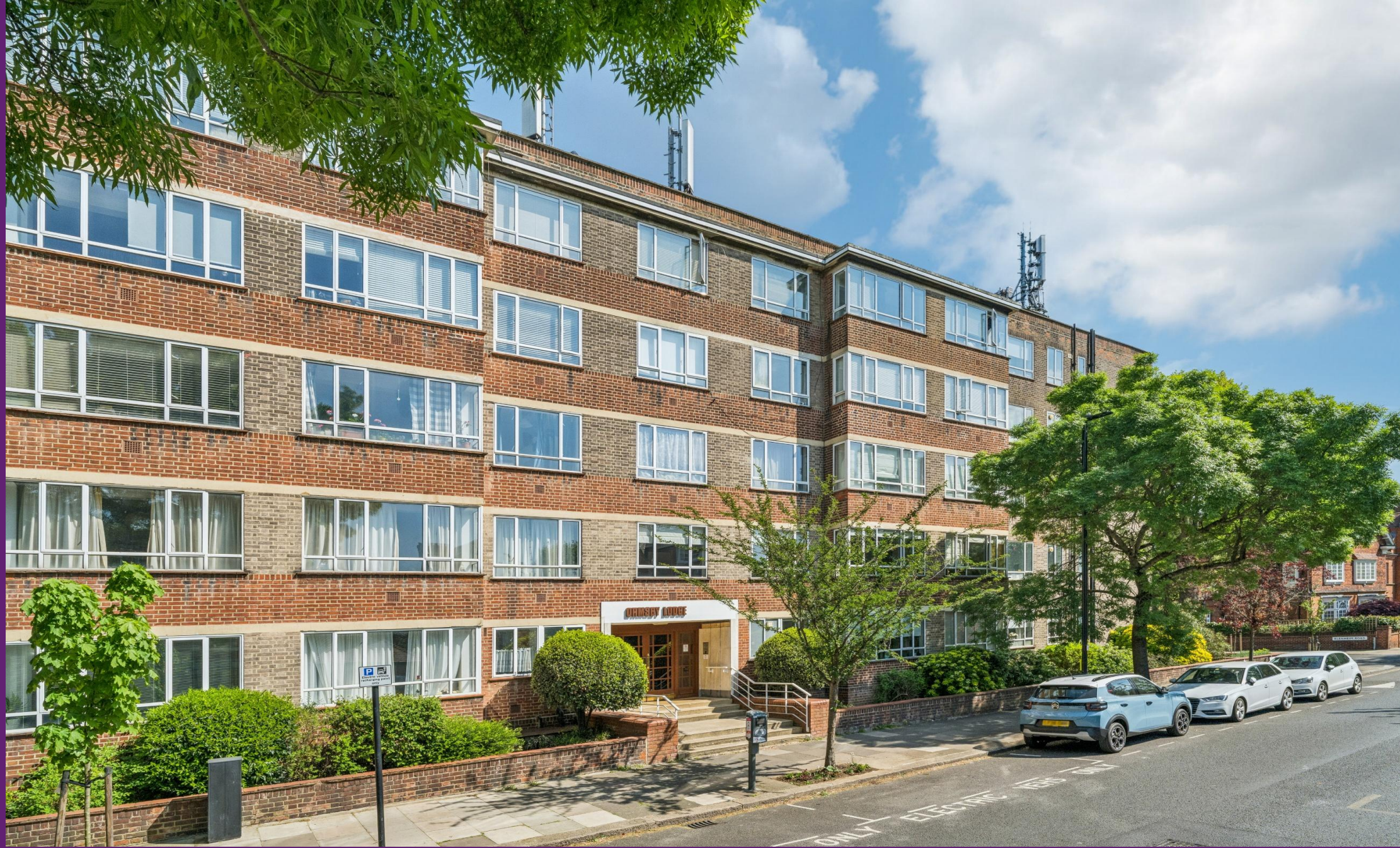
Ormsby Lodge The Avenue, W4