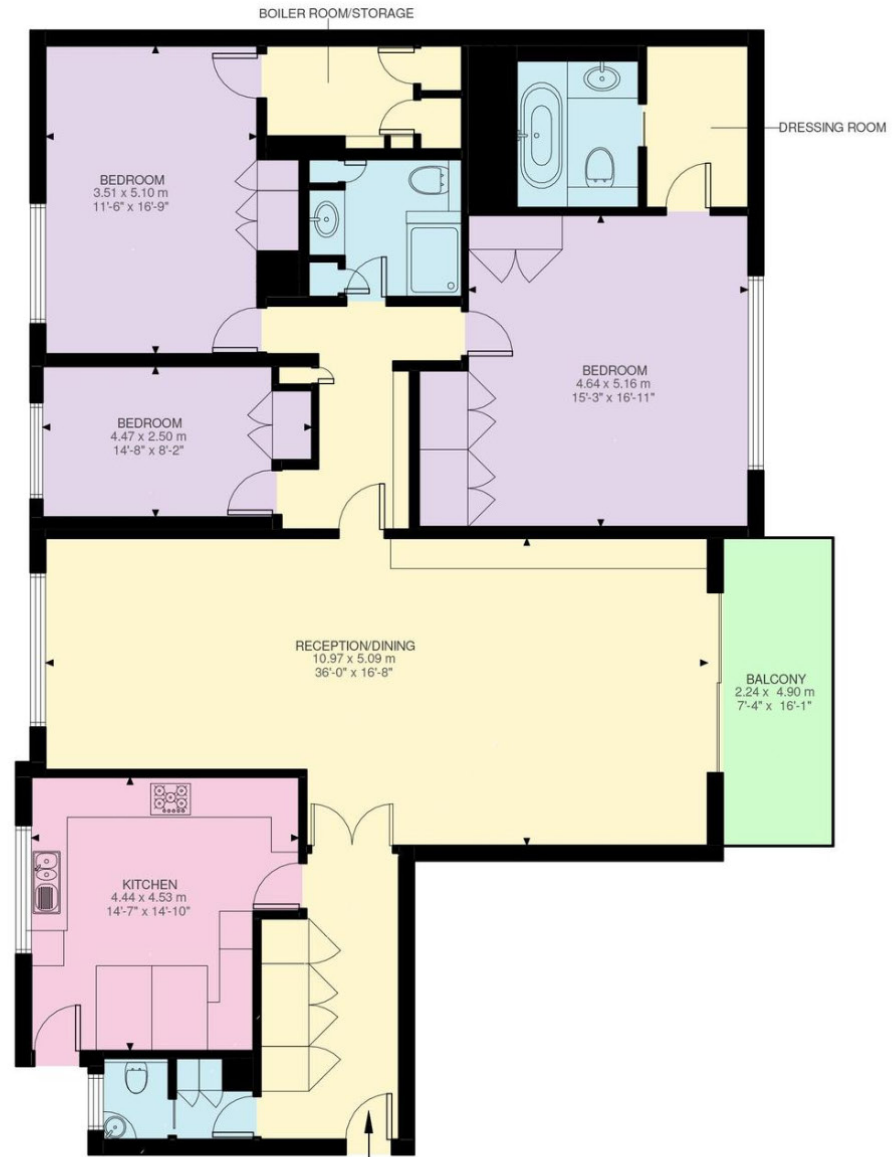
First Floor 1934 ft 2

Approximate Gross Internal Area = 179.67 sq m / 1934 sq ft