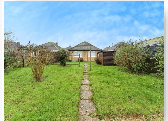
Green Street, March PE15 9DZ