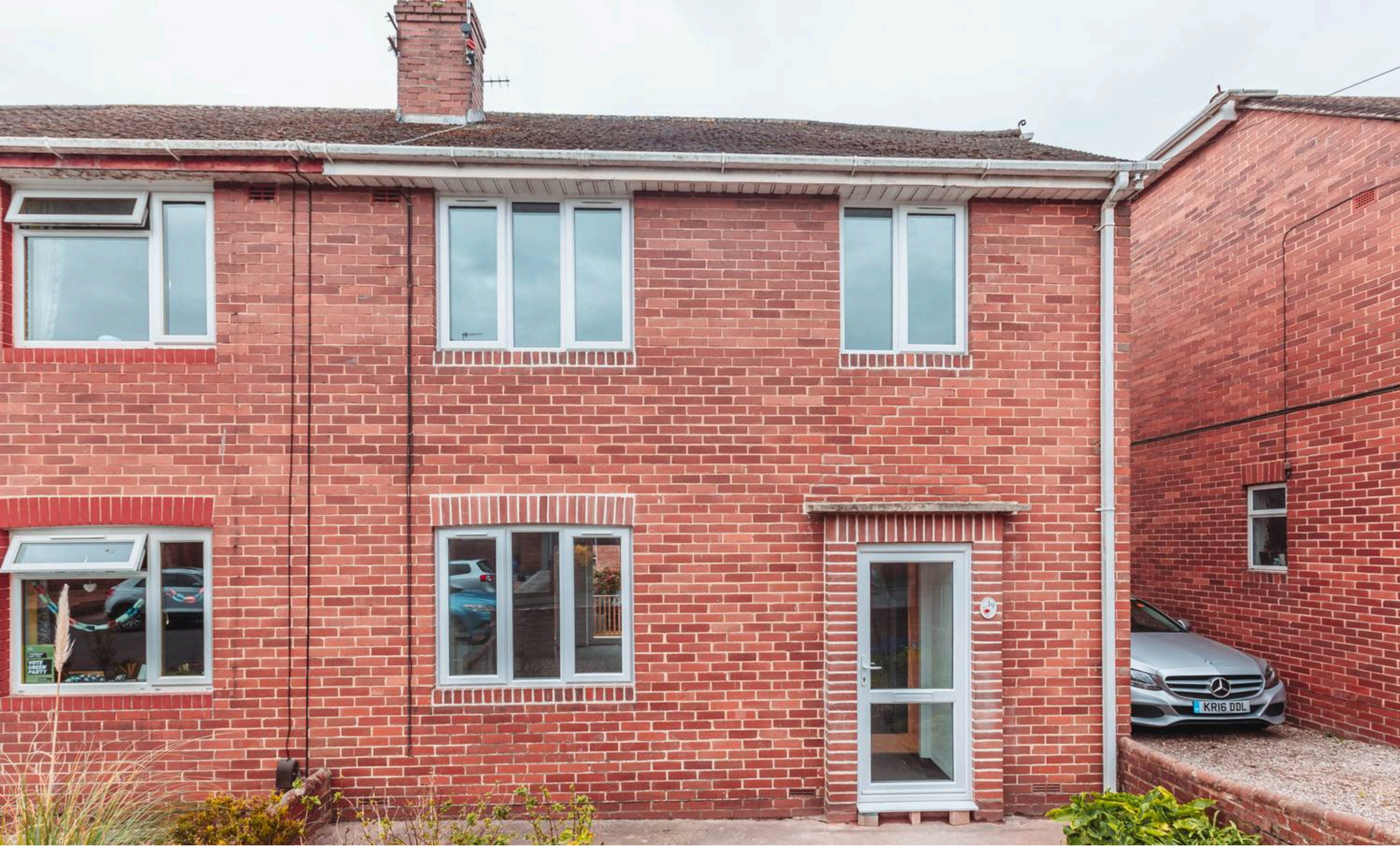
19 Kingsway, Exeter, EX2 5EN £1,600 pcm