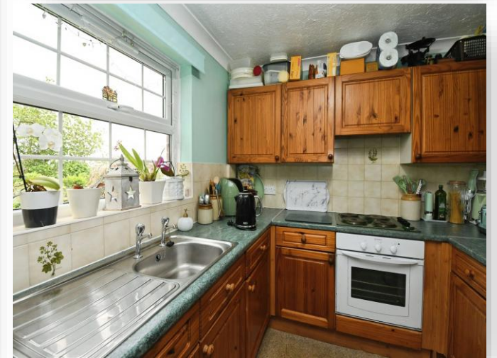
College Close, Wainfleet Skegness PE24 4EN