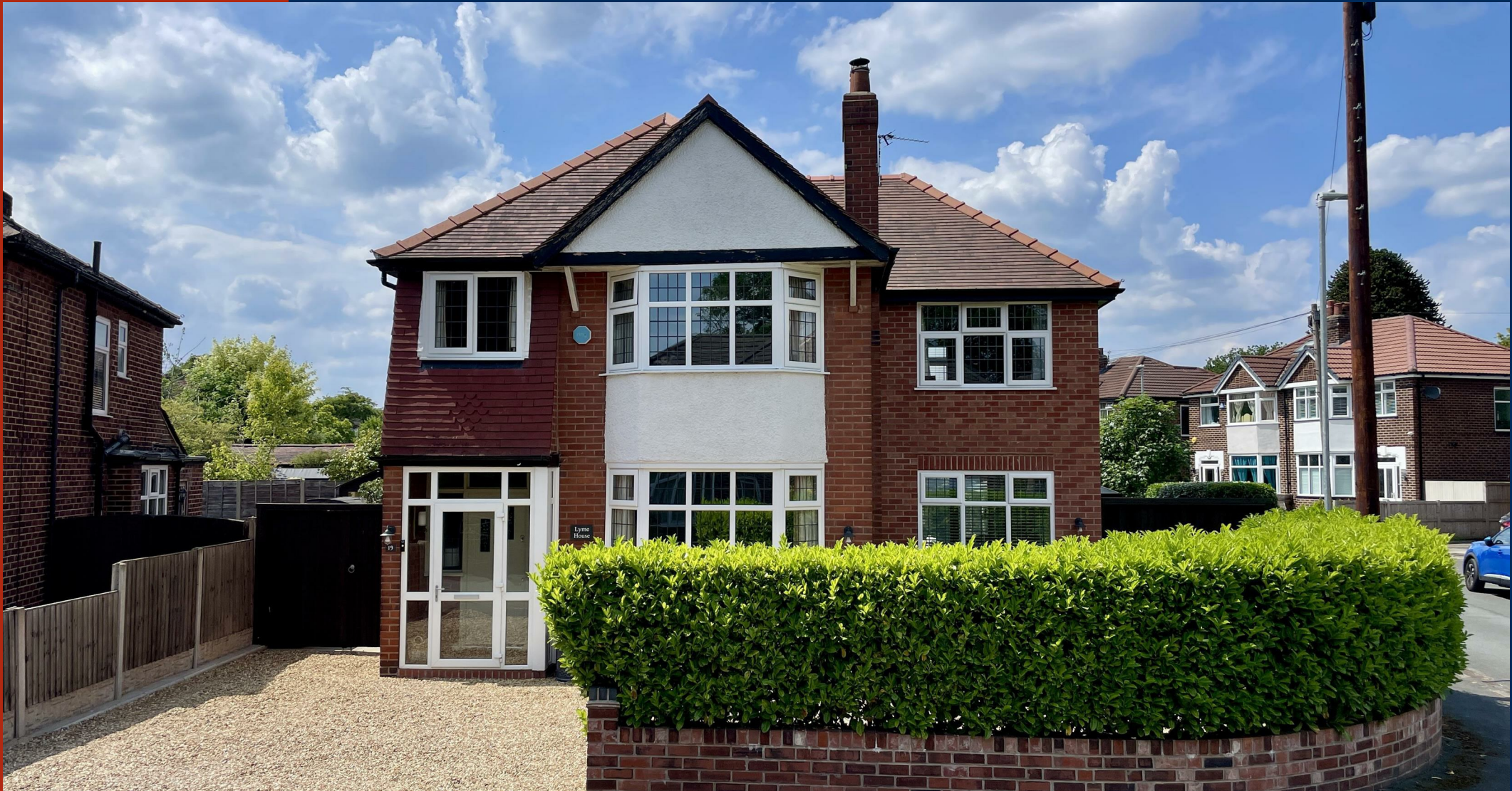
Lyme House 19 Kilvert Drive, Sale, M33 6PR