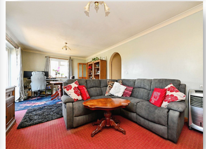
The Drove, Barroway Drove, Downham Market, PE38 0AJ