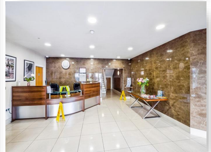
Meridian Plaza Bute Terrace, Cardiff CF10 2FP