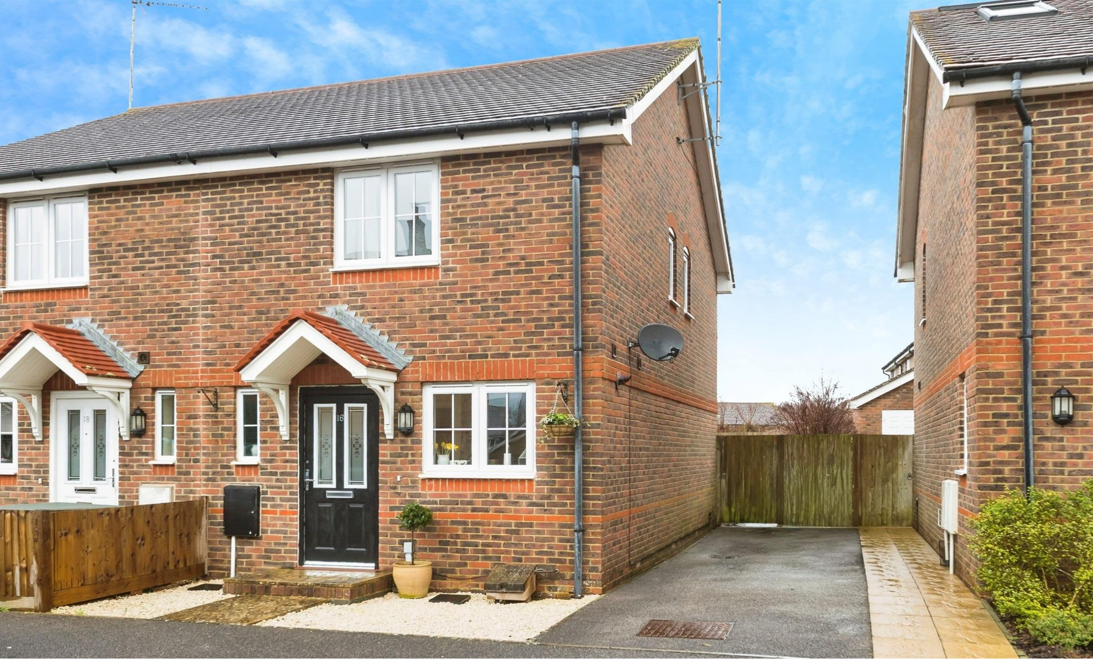
Sycamore Way, Hassocks, BN6 8YH