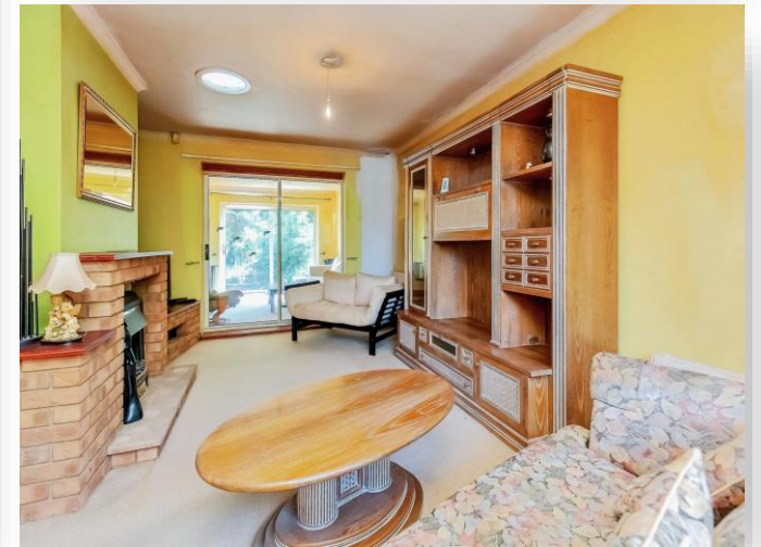
Fernie Close, Barton Seagrave Kettering NN15 6RE