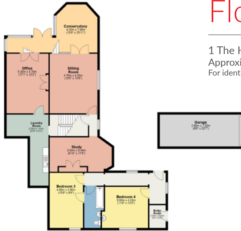
Ground Floor Approx. 133.8 sq metres (1438 sq. feet)

1 The Hoo, Ambleside Road, Windermere, LA23 1NF Approximate Area = 3862.8 sq ft / T358.9 sq m For identification only - not to scale