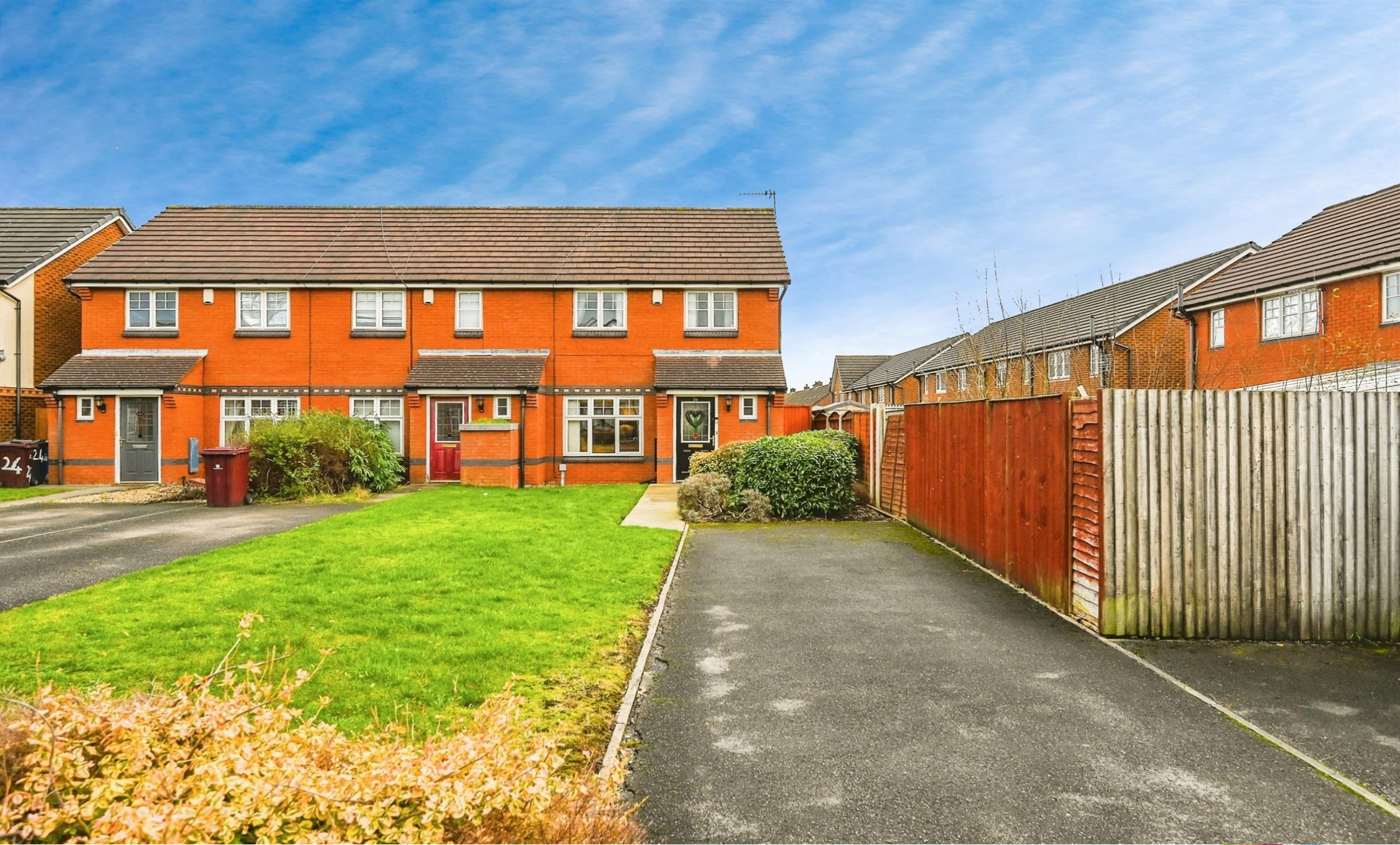
Beechfield Close, Liverpool L26 1YQ