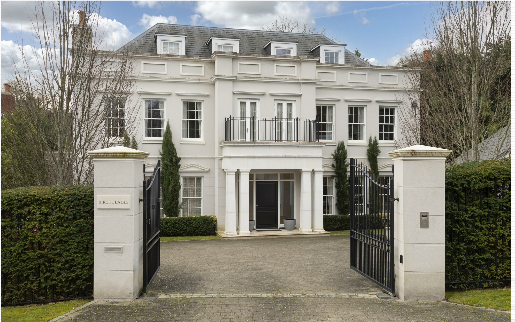
Coombe Park, Coombe, Kingston Upon Thames, KT2 7JB