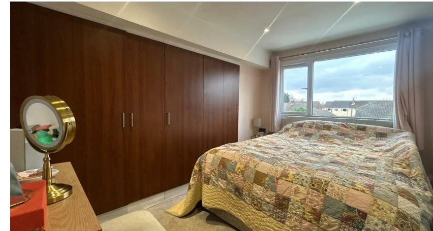
Oakdale Drive, Heald Green

To view this property call Main & Main on 0161 437 1338