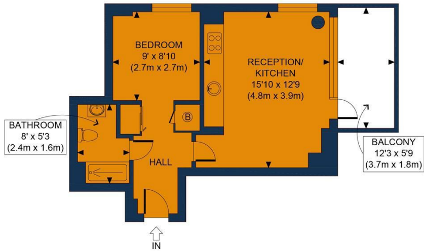
SIXTH FLOOR GROSS INTERNAL FLOOR AREA 558 SQ FT