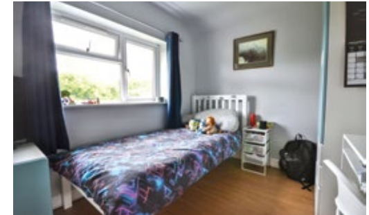
Approx Gross Internal Area 106 sq m / 1129 sq ft