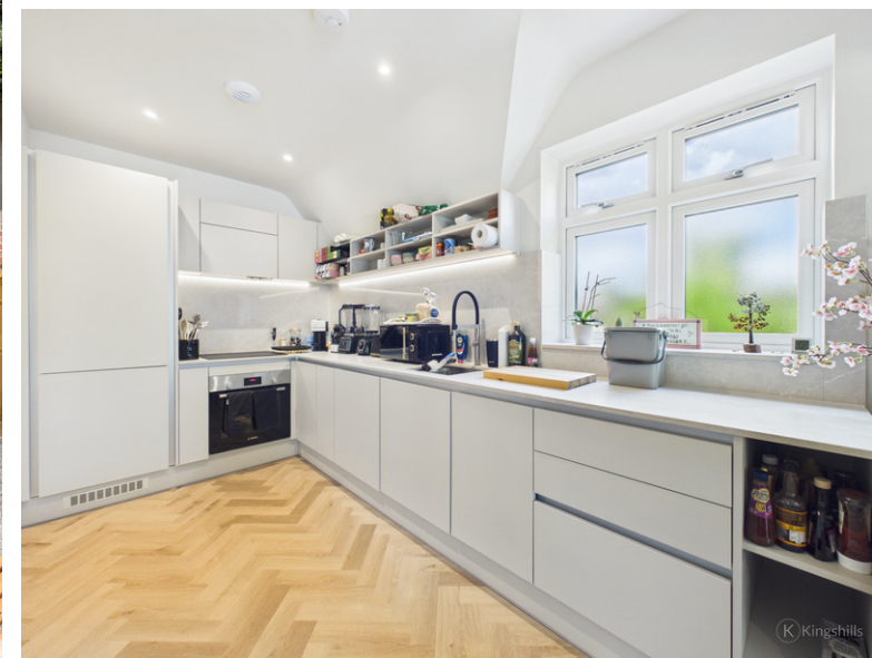
Flat 9, 141 London Road, High Wycombe, Buckinghamshire, HP11 1BT