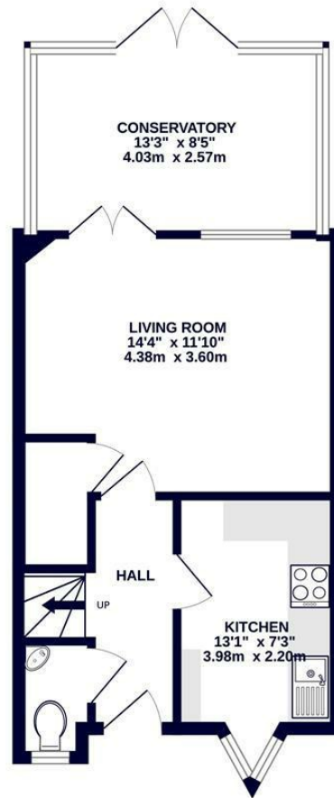
GROUND FLOOR 439 sq.ft. (40.7 sq.m.) approx.