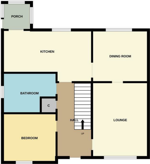
GROUND FLOOR 775 sq.ft. (72.0 sq.m.) approx.