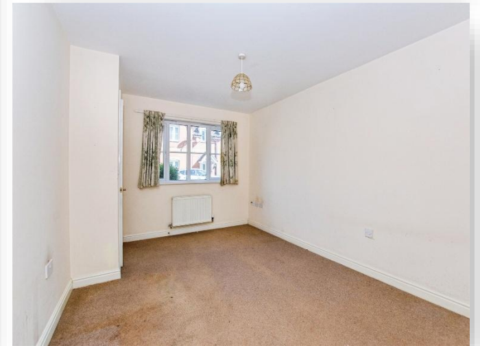
Copperfields, Wisbech PE13 2HJ