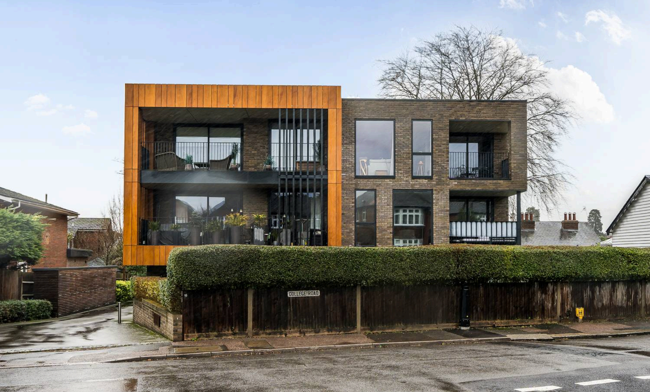
Copper Beech House, 15 College Road Epsom