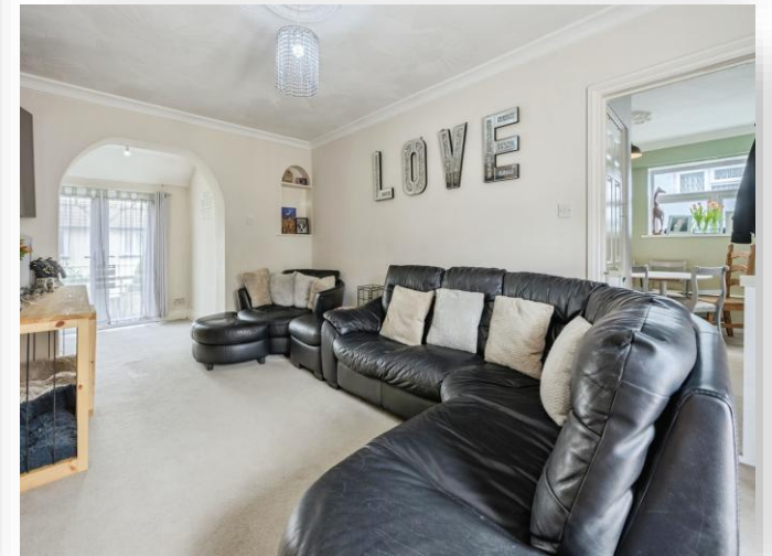
George Avenue, Plymouth PL7 2DB