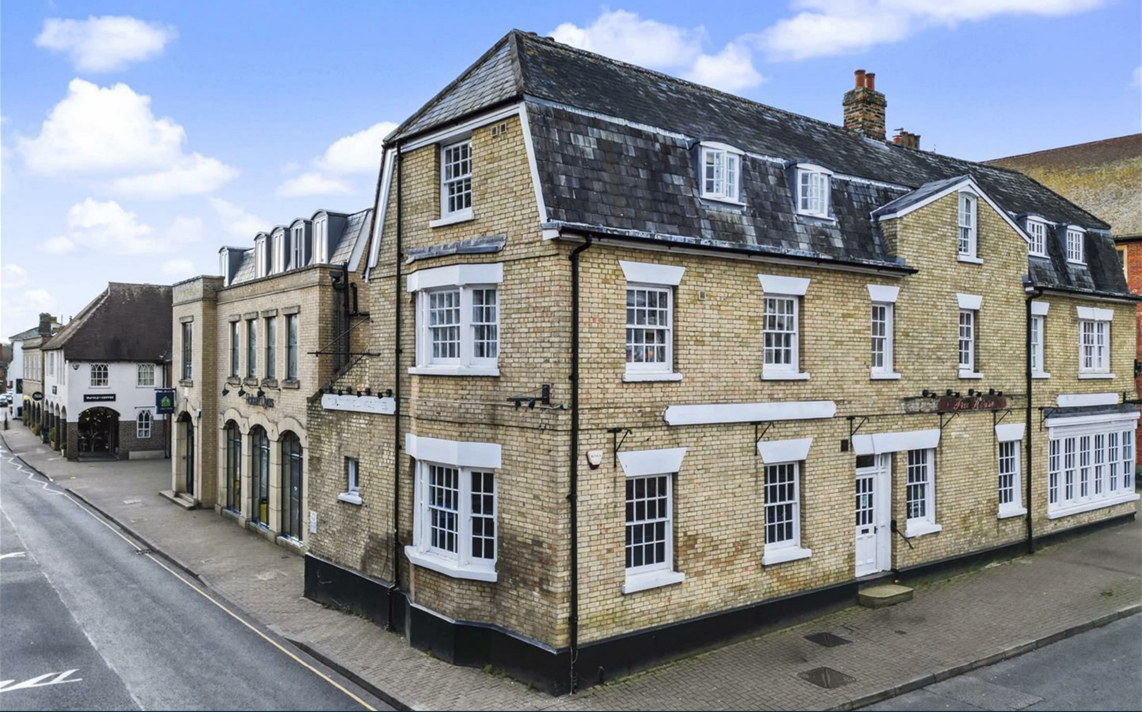
White Horse Apartments, Saffron Walden, CB10 1JD