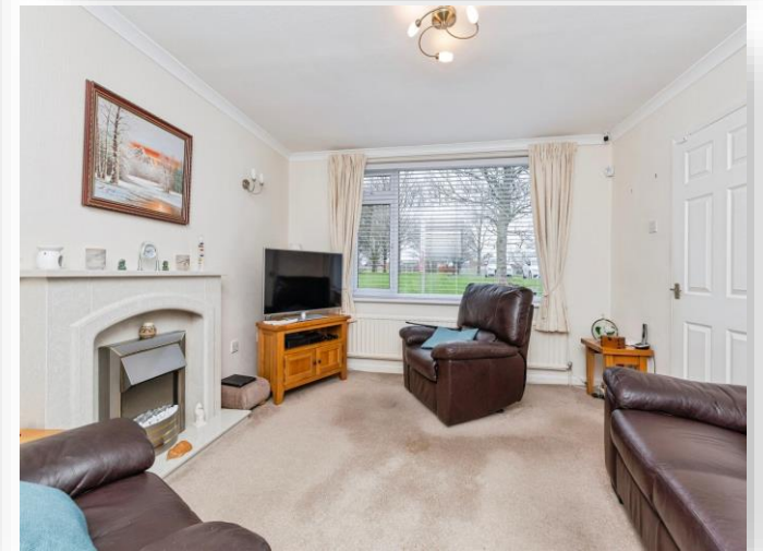
Bannockburn Way, Billingham TS23 3QL