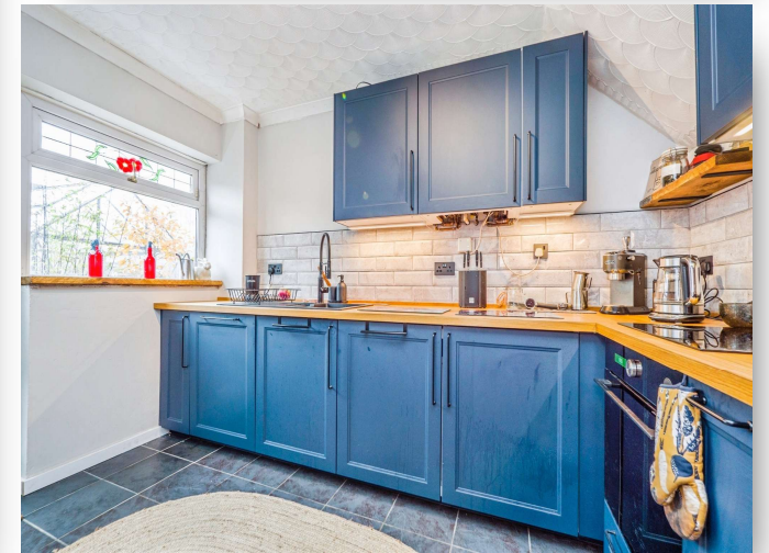
Bryn Pinwydden, Pentwyn Cardiff CF23 7DG