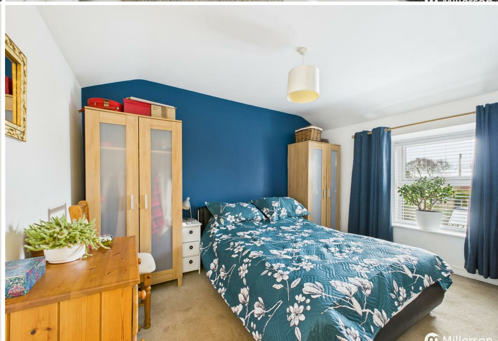
Brokenshire Corner, Carharrack, Redruth, TR16 5RB