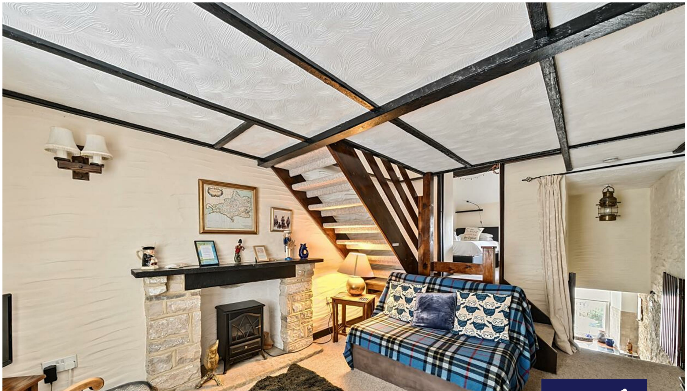
"Two Hoots" 82a High Street Swanage, BH19 2NY