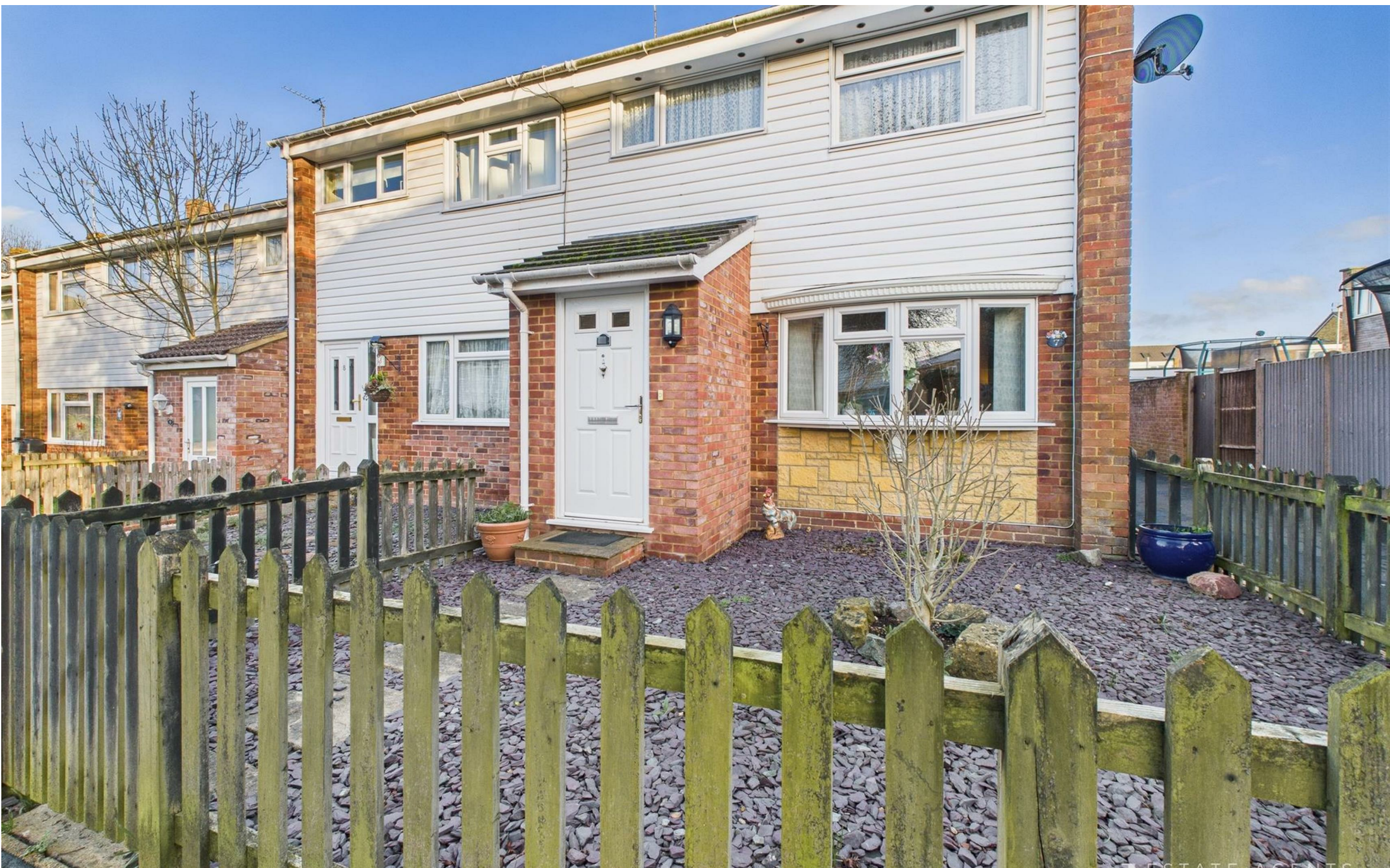
Lyn Court, Eastrop, Basingstoke, RG21 4PY £330,000 Asking price - Freehold