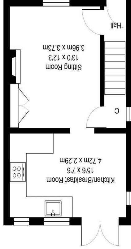
Floorplan not to scale and for illustration purposes only. All measurements are approximate.

Waghorn & Company is a trading name of Waghorn & Company Limited Registered in England at the above address Company number 07243982