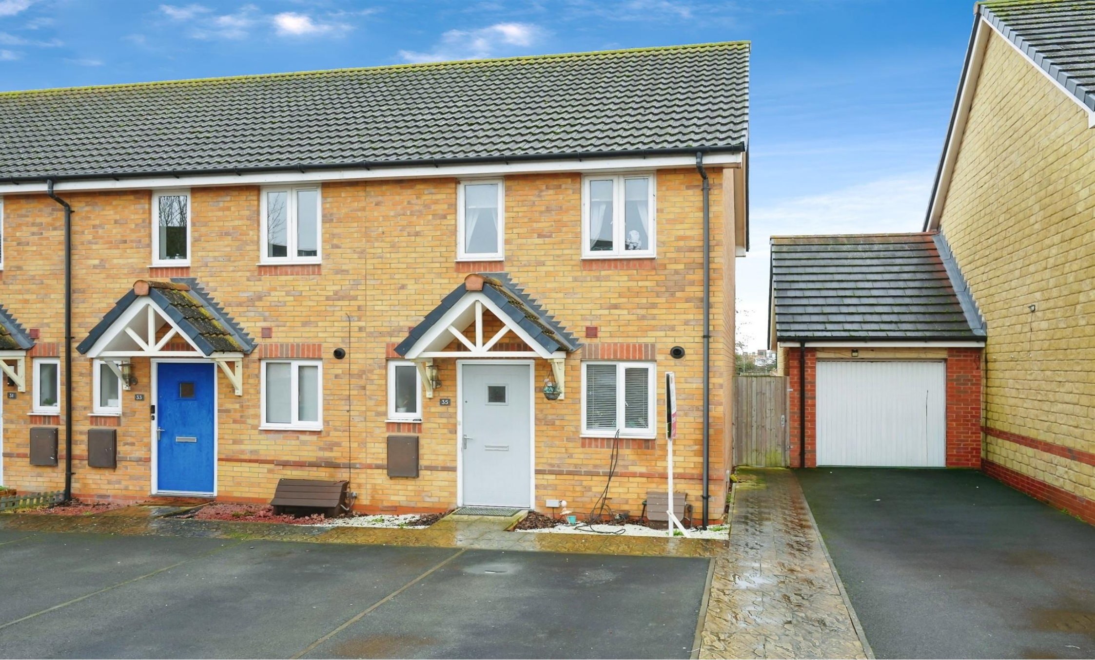
Foxglove Way, Didcot OX11 6EQ