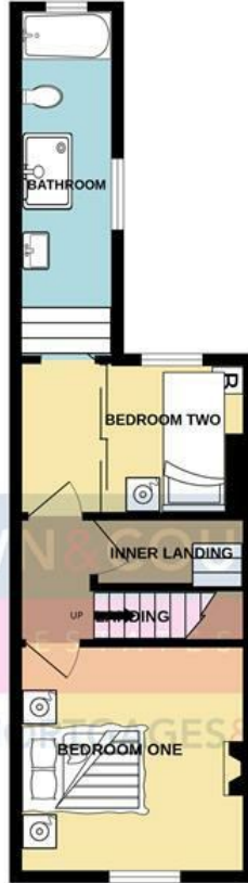
1ST FLOOR 332 sq.ft. (30.8 sq.m.) approx.