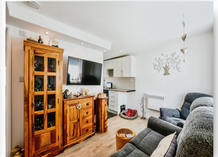
Mablethorpe Park, Mablethorpe LN12 2AP