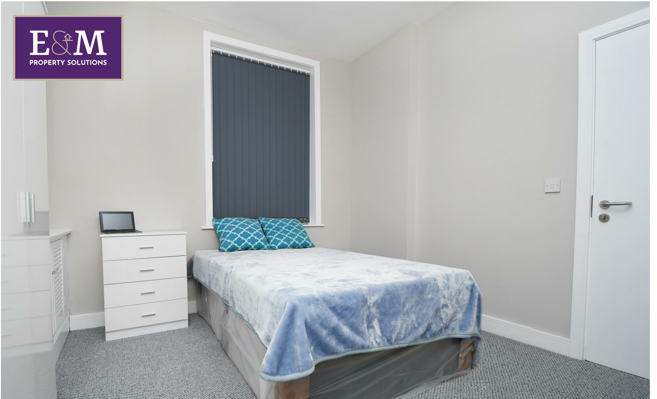
ROOM 1, 12 Ulster Street, Burnley, Lancashire, BB11 4NX £100 Per week