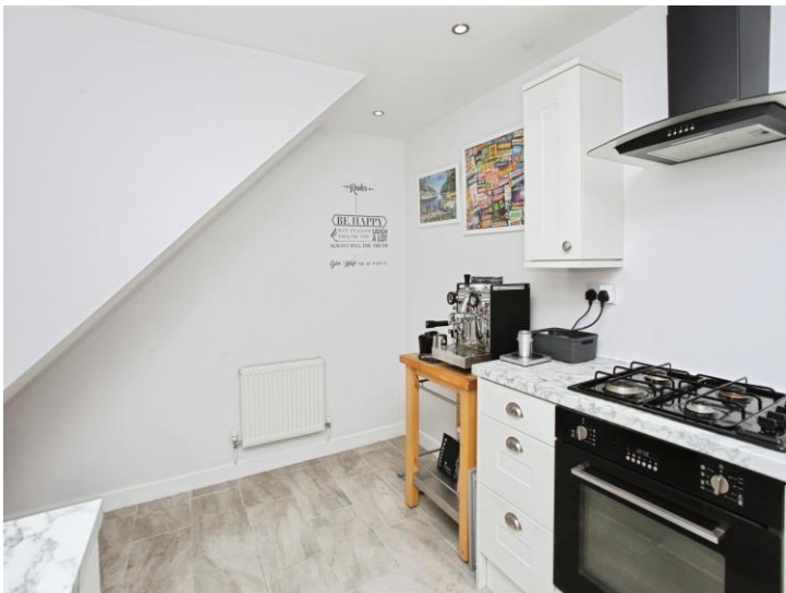
9' 2" x 6' 9" ( 2.79m x 2.06m )