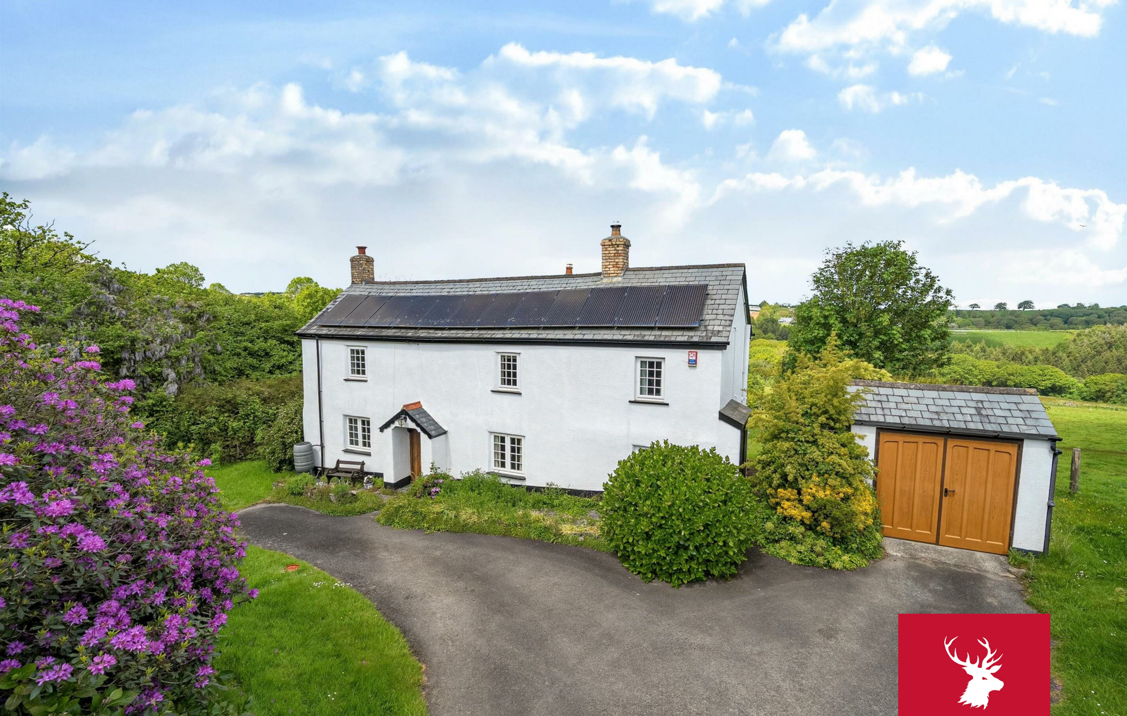
North Down Farm