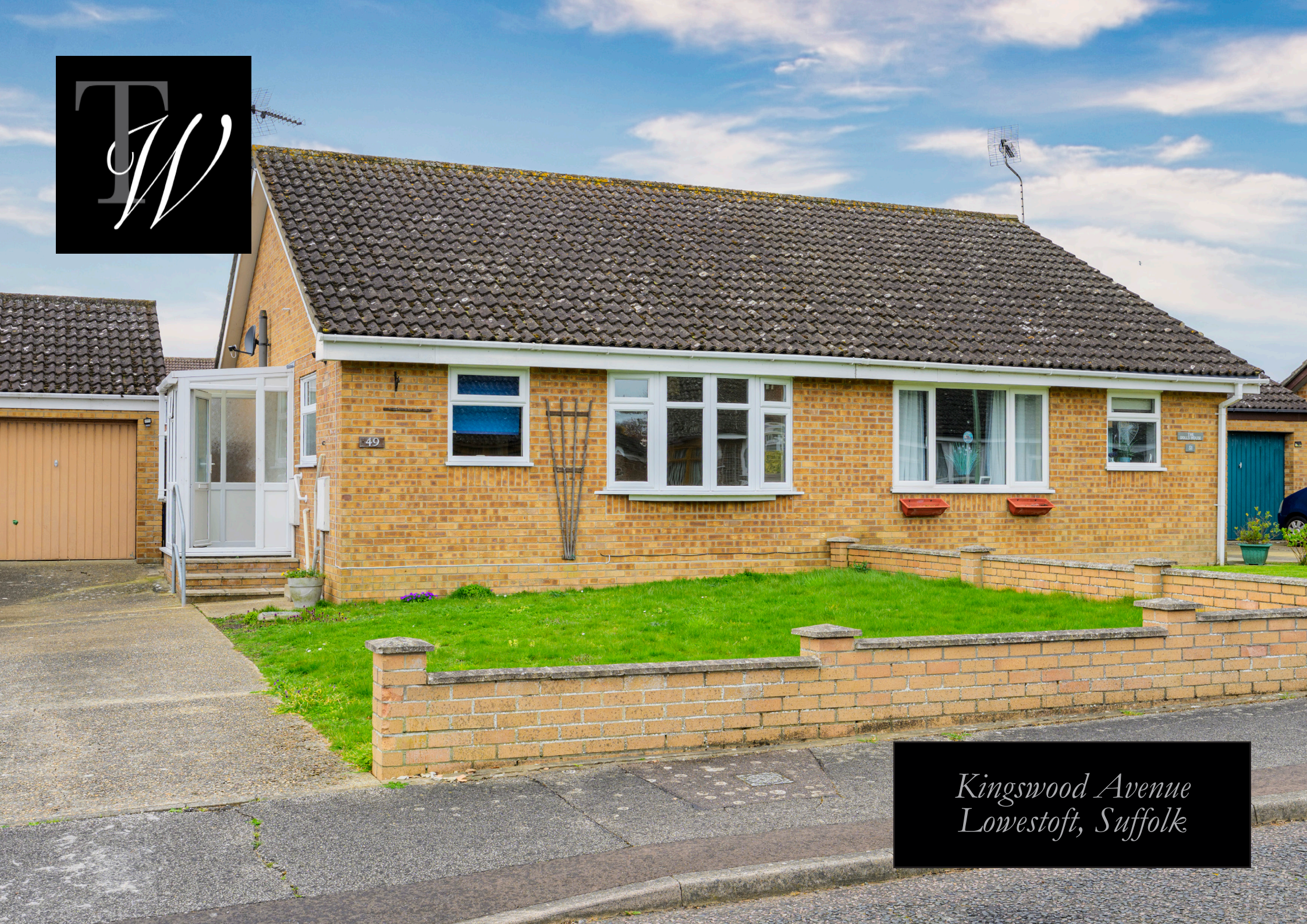
Kingswood Avenue Lowestoft, Suffolk